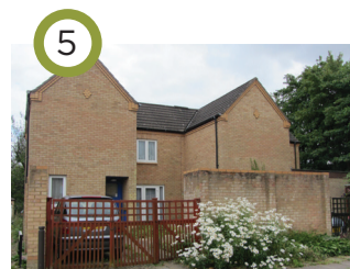
5 Fishermead 5 (MKDC, 1981) A shift in design with two storey houses with pitched roofs around mixer courts with no distinction between footpath and road. Nearby, in Helston Place, a scheme of MKDC Starter Homes, built for sale rather than rent: architecturally modest.