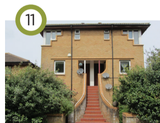
11 Oldbrook 6 (MKDC, 1982) Shared ownership scheme with standalone blocks comprising two ground floor flats and sweeping staircase to the two maisonettes on the first and second floors, a development of the blocks in Oldbrook 1 and a clever way to give architectural dignity to small dwellings.