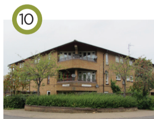
10 Oldbrook 3 (Phippen Randall and Parkes, 1980-81) PRP were some of the most prolific architects in MK designing houses for both MKDC and private developers. Generous hipped roofs, particularly noticeable above the balconies of the corner blocks of flats.