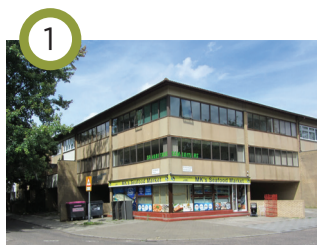
1 Fishermead 1 and 2 (MKDC, 1972) Three storey houses backing onto landscaped greens. Facades of glazing and fibre cement panels spanning between the party walls. Projecting balconies form carports beneath. Corner blocks of flats and maisonettes with the ground floors either fitted out for commercial use or left vacant for such uses in the future.