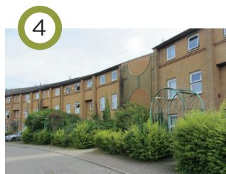
4 Fishermead 7 (MKDC, 1982) Three storey crescent that was originally planned for a mirror site in Conniburrow but moved to Fishermead as a result of poor ground conditions. A suitably grand scheme to mark the termination of MKDC's rental housing programme.