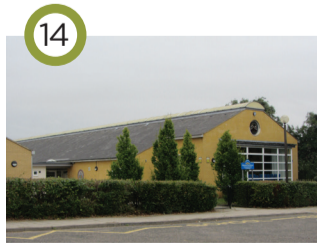
14 Oldbrook First School (Bucks County Council, 1994) One of a new wave of school designs that moved away from the more traditional image adopted by BCC. Linear design with classrooms off a spine. Big gridded window overlooking Oldbrook Green. Subsequent extension by Stenton Obhi Architects.