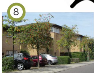
8 Oldbrook 1 (MKDC, 1980) Three storeys and pitched roofs from the outset. Backing onto the Local Park, cluster blocks combining smaller units to make detached pavilions – a new departure for MKDC. Shallow pitched roofs and deep eaves in the manner of Frank Lloyd Wright's Prairie Houses.