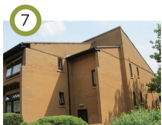
7 Frank Howe Court (Trevor Denton, 1983) Elegant L-shaped sheltered housing scheme for the Royal British Legion by the architect who previously led the Central Area Housing design team within MKDC. Opposed monopitch roofs and the architect's distinctive projecting brick fins.