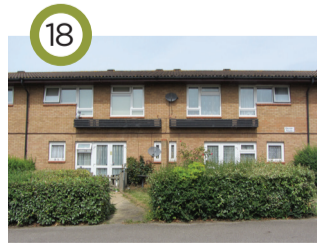
18 Dexter House (MKDC, 1982) L-shaped sheltered housing around a landscaped court, one of a number of sheltered housing schemes designed by MKDC throughout the city.