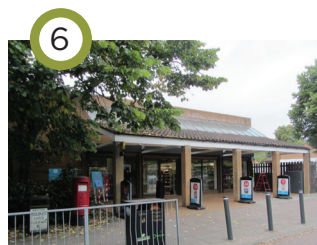
6 Local Centre (MKDC, 1979) Combined development of a local supermarket and a multi-use community centre (the Trinity Centre) that also functions as the local church. The supermarket has an abnormally wide sheltering canopy.