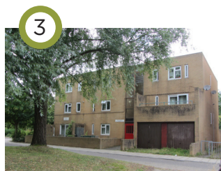
3 Fishermead 3 (MKDC, 1976) Three storey brick facades punctured by windows. Balconies are either at the front or rear depending upon orientation – an early MK example of planning for solar gain. The corner blocks, with distinctive glazed staircase lobbies, still have their flat roofs.