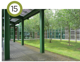
15 SIA House (Sansome Hall, 2005) Energy conscious building with green roof and photovoltaic cells for the Spinal Injuries Association.