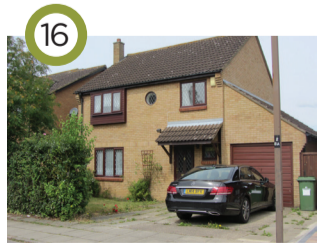
16 Oldbrook B (Various, 1981 onwards) Individual plots for self-build housing were an important part of MKDC's housing provision. Each site had its own brief detailing building zones, choice of materials etc. Most of the buildings, as here, are relatively conventional in appearance.