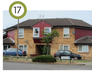
17 Oldbrook 4 (Design Research Unit, 1989) Inclusive housing and bungalows built by Habinteg, a housing association established to provide housing for people with disabilities. Cranked blocks address the roundabouts.