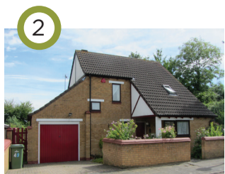
2 Fishermead C/D (Denton Tunley Scott, 1989) Modest and small-scale private housing arranged around a wedge of open space leading out of the gridsquare. Distinguishing concrete lintels over the windows.