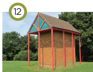
12 Oldbrook Green (MKDC, 1984) Three cheerful service buildings on the cricket green at the heart of the gridsquare – a pavilion, landscape depot and a utility building.