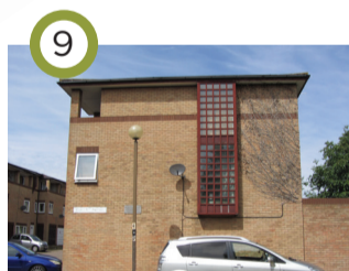
9 Oldbrook 2 (Colquhoun and Miller, 1980-83) Three storey mews courts leading towards CMK with two storey cross streets with linking pergolas over the parking spaces. Oriol staircase windows form dramatic features at the ends of the taller blocks. Crinkle crinkle walls line the interior greens.